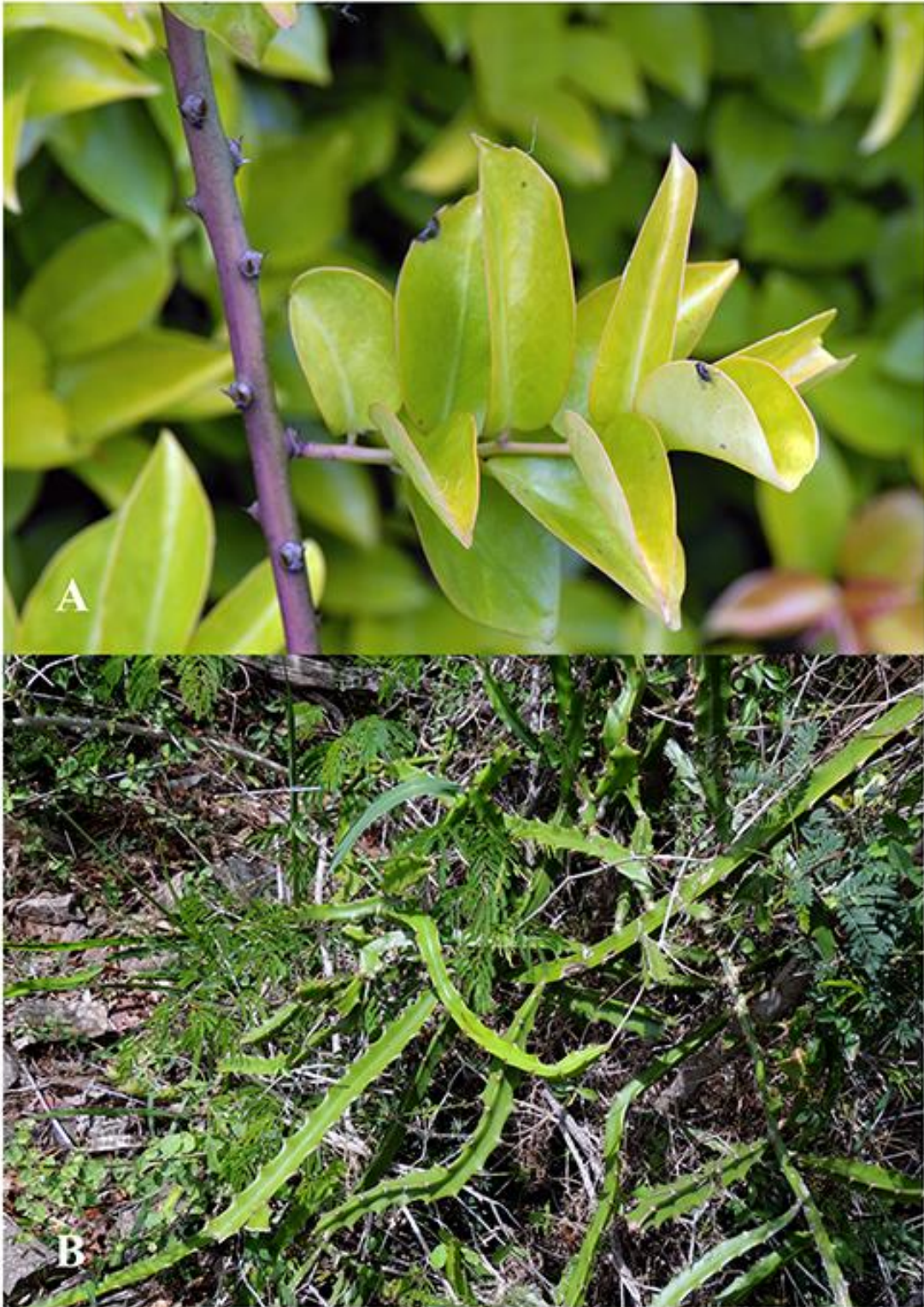
Figure 69. A. Habit in Pereskia aculeata , with short lateral branch. B. Scrambling habit of Selenicereus triangularis .