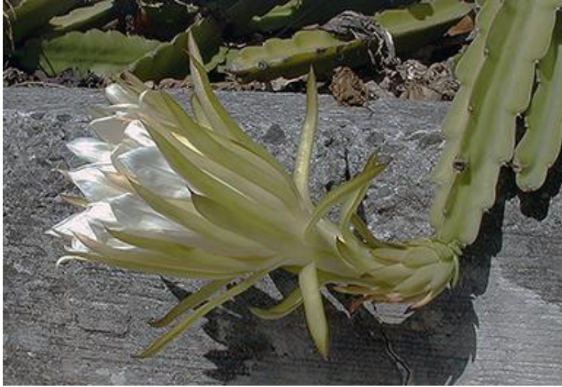
Selenicereus triangularis , photo by P. Acevedo.

Lianas, climbing by adventitious roots, unbranched or with numerous lateral branches.