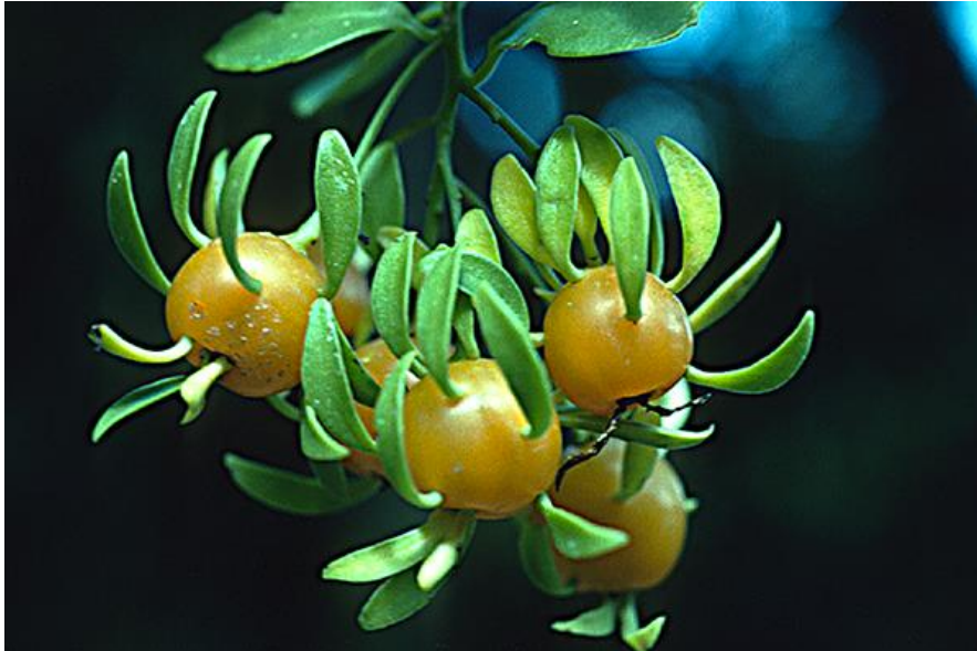
Pereskia aculeata , photo by P. Acevedo.

Shrubs, trees or scrambling, sometimes twining lianas. Stems cylindrical, without ribs,