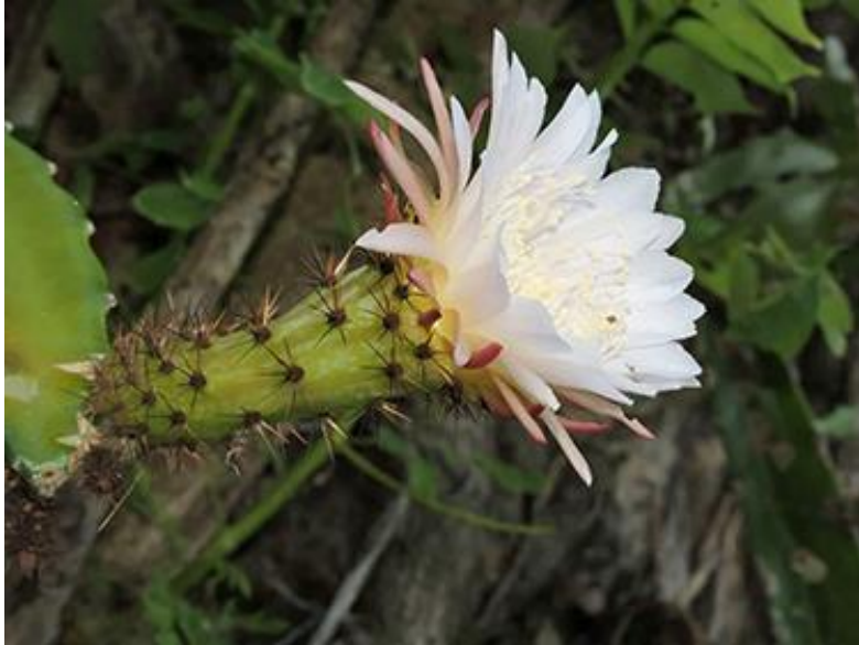
Weberocereus tonduzii

Lianas, climbing by adventitious roots, with numerous basal branches. Stems green,